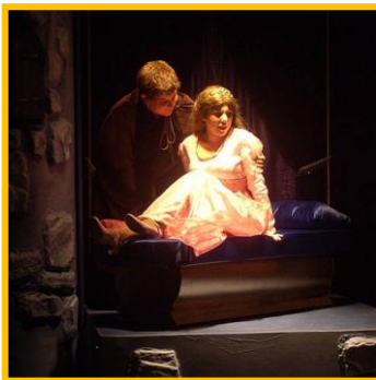
Sleeping Beauty, 2009

The Newington Children's Theatre Touring Company has been producing theatre for children and by children throughout Connecticut for the past forty-seven years. The company began under the sponsorship of the Newington Parks and Recreation Department, and, for the past seven years, has been an independent, nonprofit organization.